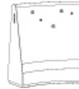
MT 3050 Curve 45 degree Inner radius 1250