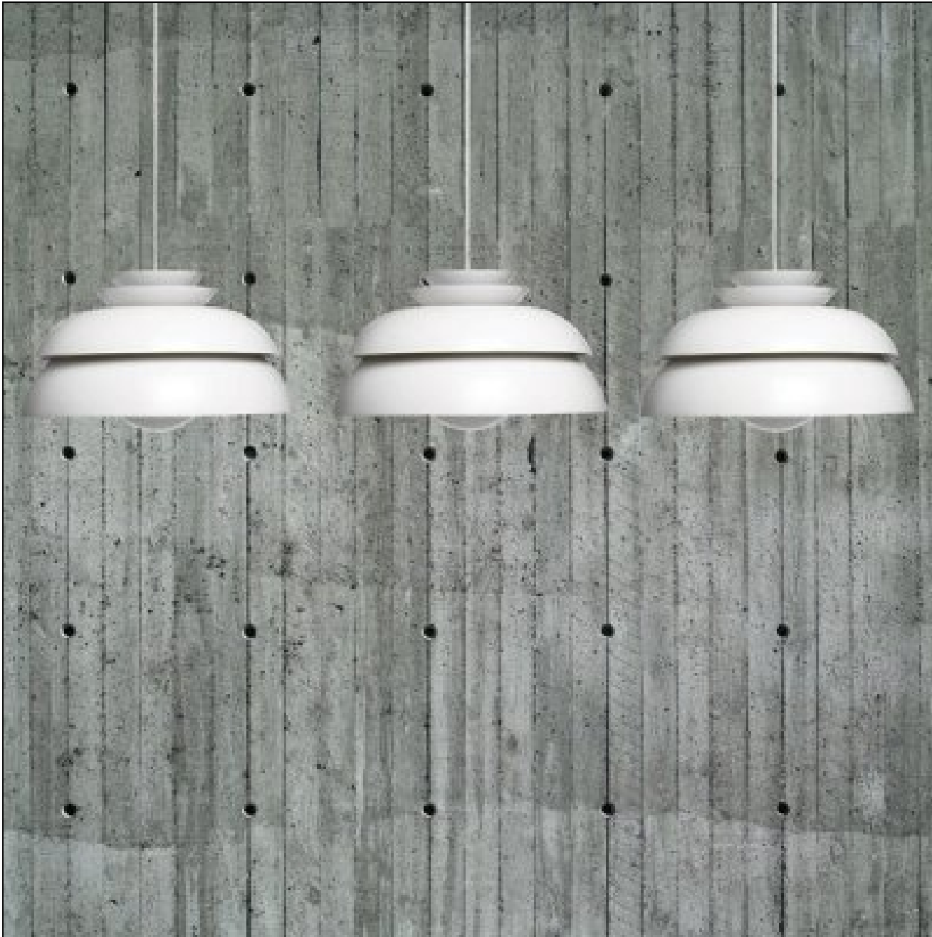
Concert Pendant Fixture